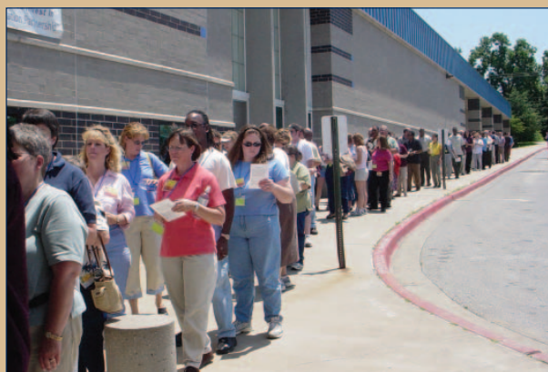
Volunteers wait in line at a dispensing exercise.

But not for you and your employees. You planned ahead, and are activating your PRIVATE Dispensing Site. Your employees know that they and their families can avoid the public dispensing sites and get their medications at work. With important paperwork already on file, the process is quick and easy. Your employees and their families are protected from harm, and your business keeps running smoothly.